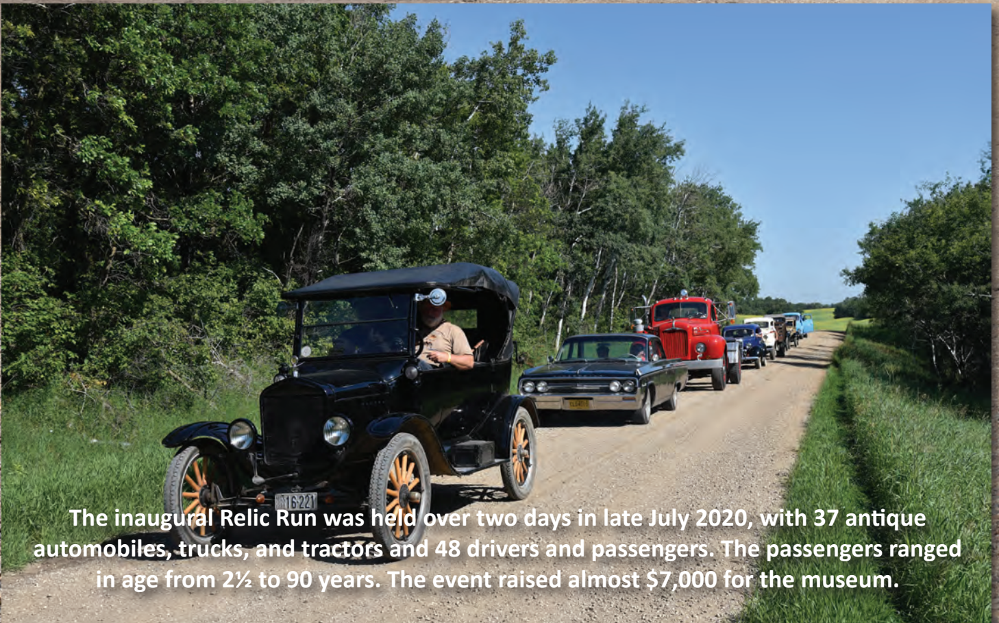
The inaugural Relic Run was held over two days in late July 2020, with 37 antique automobiles, trucks, and tractors and 48 drivers and passengers. The passengers ranged in age from 2½ to 90 years. The event raised almost $7,000 for the museum.